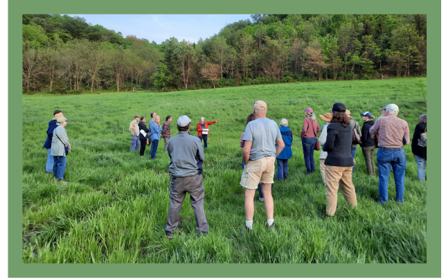
Groundwater 101 at Evenings Afield at Lowery Creek