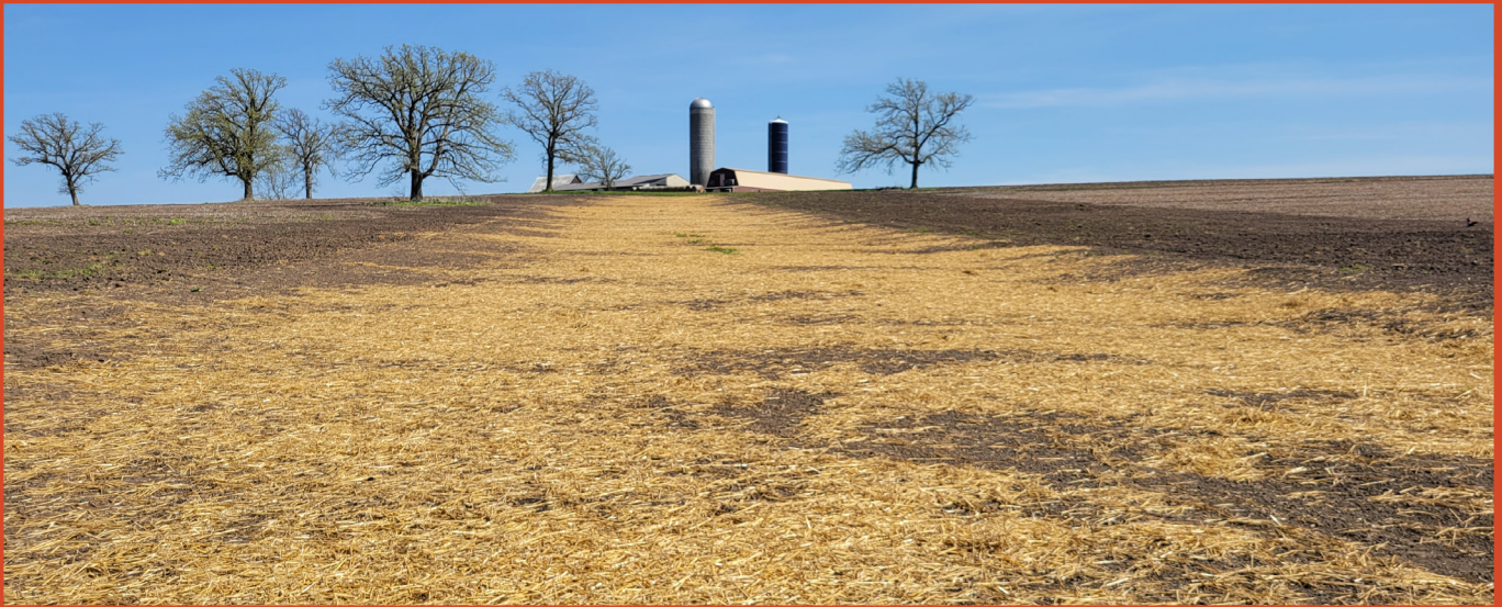
Seeded and mulched waterway