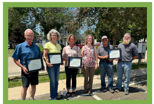
Conservation Farmer awards at Farmer Appreciation Days