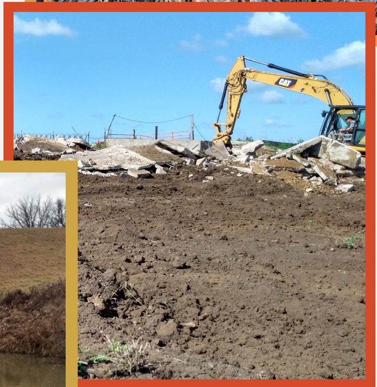
Manure storage closure in process