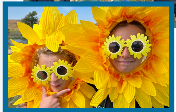
Youth Conservation Field Day at Bloomfield Prairie